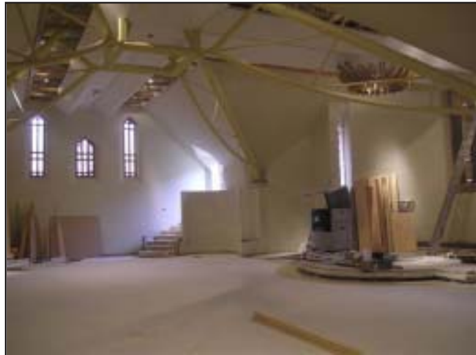
Interior of the New Church - to the sanctuary